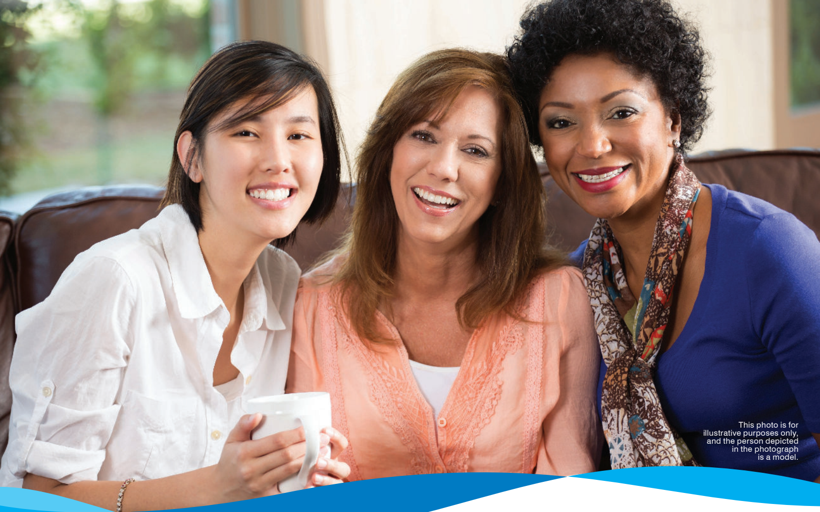
This photo is for illustrative purposes only, and the person depicted in the photograph is a model.